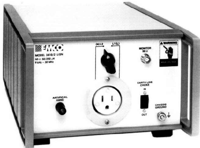
Model 3810/2 LISN

The Model 3810/2 series of Line Impedance Stabilization Networks have been certified by the Canadian Standards Association to be in compliance with CAN/CSA-22.2 No 1010.1-92 (Safety Requirements for Electrical Equipment for Measurement, Control and Laboratory Use). This certification states that the Model 3810/2 series complies with the applicable requirements of the NFPA National Electric Code.