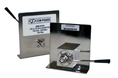
ADA-515-2 Adapter Set