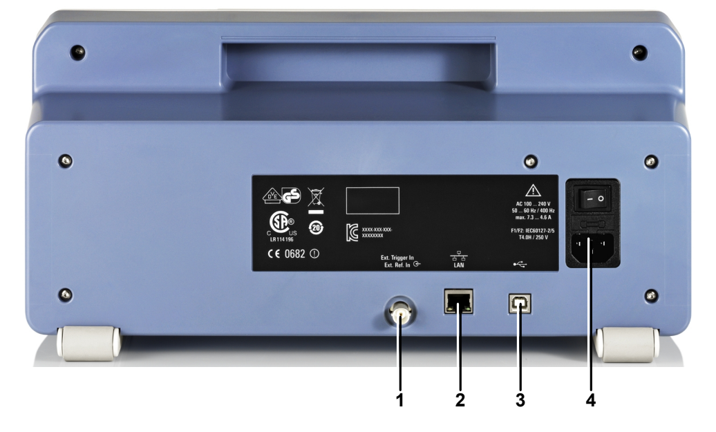
Figure 4-2: Rear panel of the R&S FPC