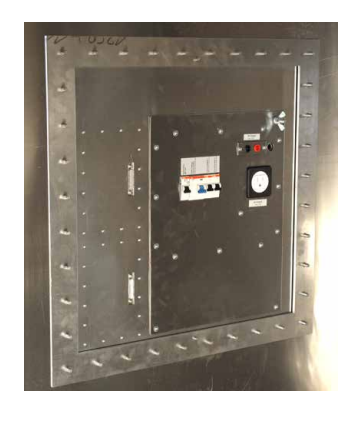
Option EUT BOX-1, DC1 and 2x SIF RC, view from inside