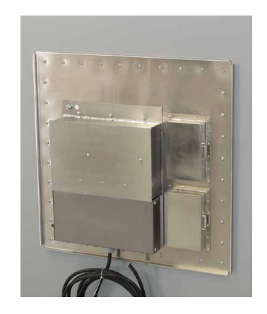
Option EUT BOX-1, DC1 and 2x SIF RC, view from outside