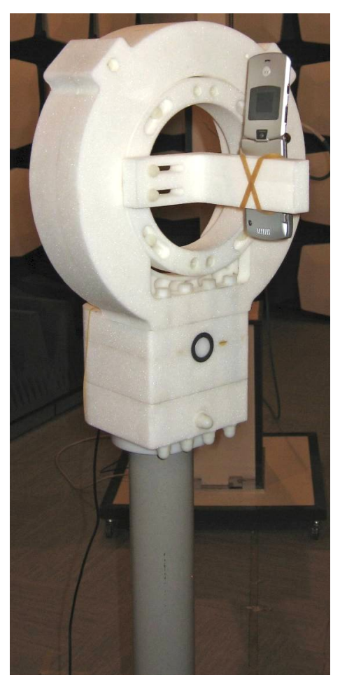
Fig.: Fixing of EUT at TD 1.5-2kg

Information presented enclosed is subject to change as product enhancements are made regularly. Pictures included are for illustration purposes only and do not represent all possible configurations.