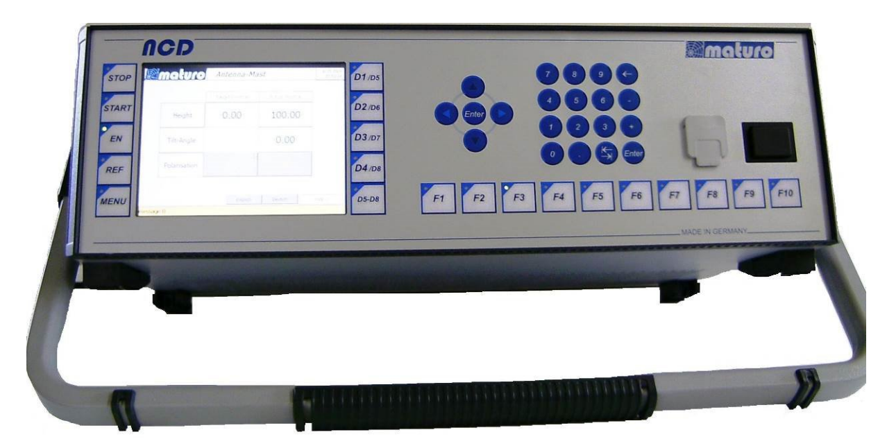
Figure: NCD with option "tip-up handle"

This controller NCD permits the operation in manual, semi-automatic and remote control mode via IEEE 488.2 (GPIB bus), or optionally other interfaces, of multiple devices simultaneously.