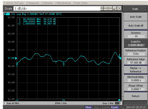
Plot 2 – Output Power @ 500W Leveled Top Curve: Mode ALC @ 57dBm, P_{IN} = 0\text{dBm} Reference: 57dB, 1dB/div.